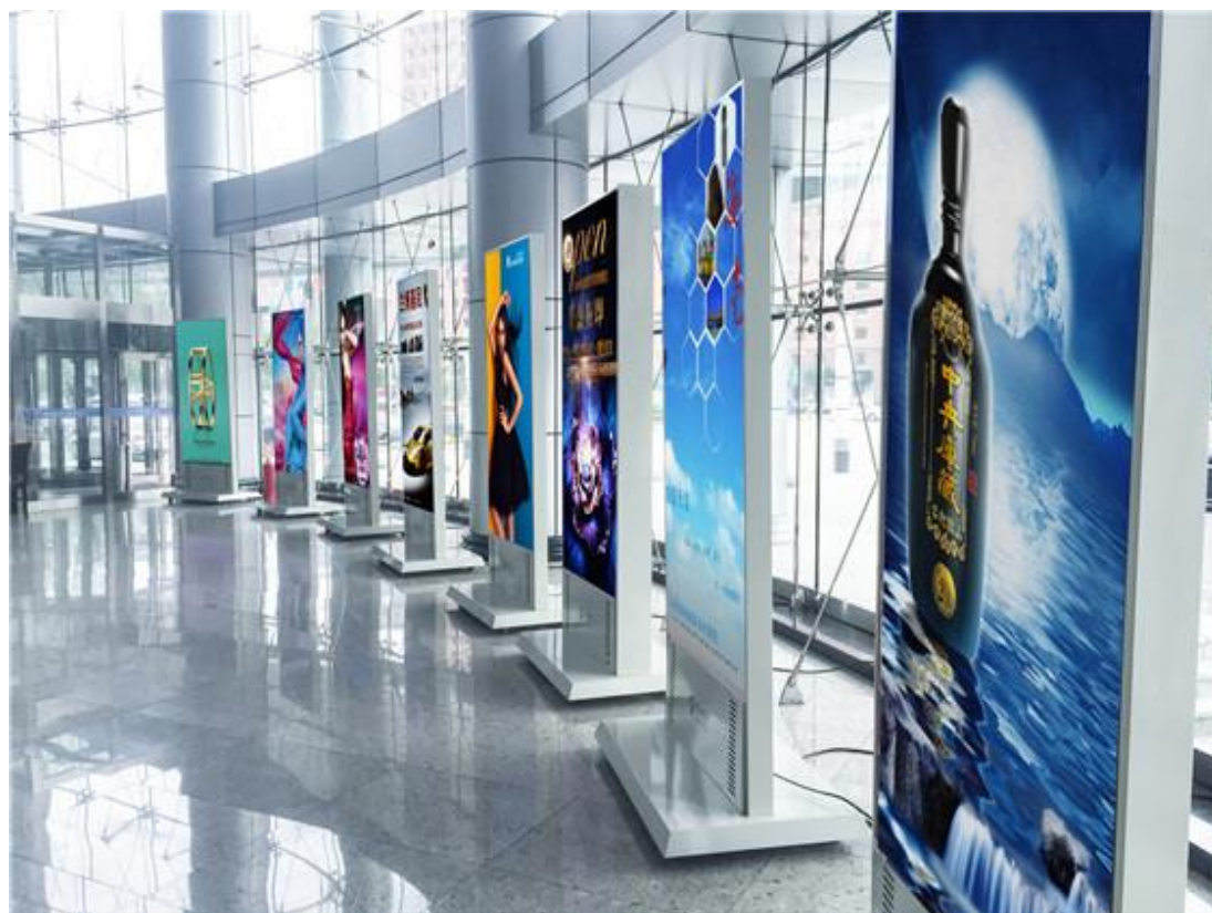
Digital Advertising LCD Display